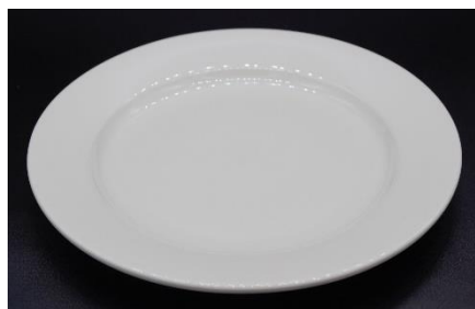
American White 10 1/2 Plate