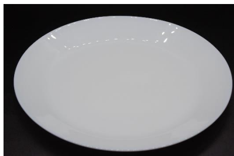
Bright White 9 3/4 China Plate