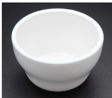
American White 8 Oz Bouillon Cup