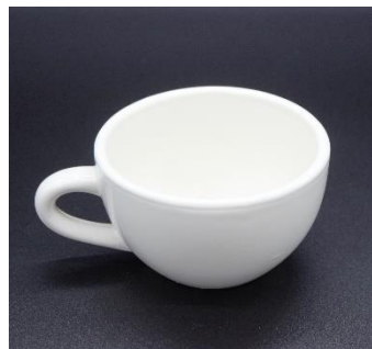
American White Coffee cup