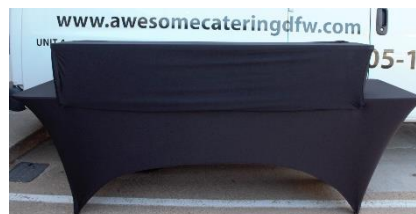
8 Ft Bar Top with black linen