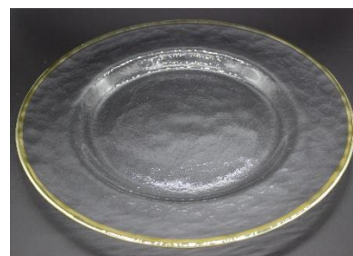
Glass Gold Rim