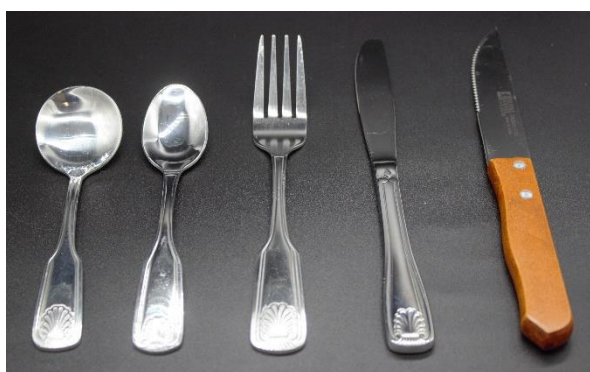
Silverware and Steak knife