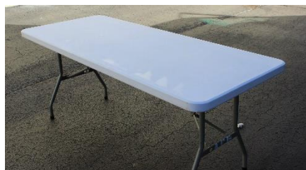
6 Ft. Rectangle Table