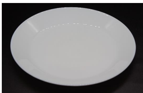
Bright White 7 3/4 China Plate